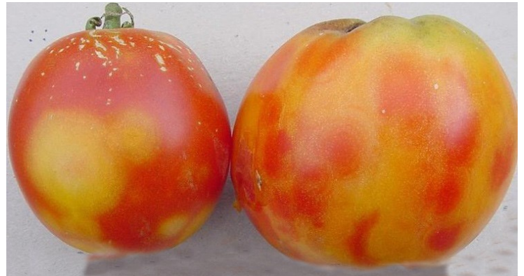
Figure 2: Fruit of TSWV infected plants may exhibit mottling.