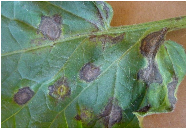
Figure 1: TSWV infected plants may exhibit a variety of symptoms, including ringspots on leaves.