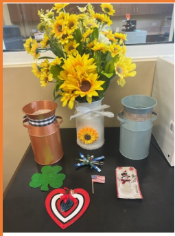
Flowers not included